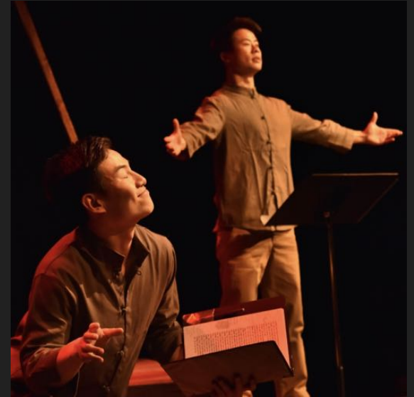
SLAC's 2019 staged reading of THE DANCE AND THE RAILROAD by David Henry Hwang

For more information about the New Play Sounding Series visit: bit.ly/SLACNPSS